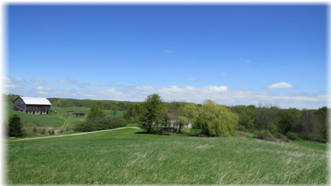
View looking north-east from The Gore Road